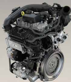
1.0 TSI 81 kW