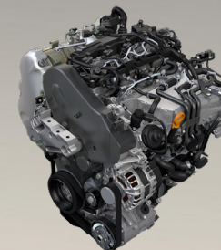
2.0 TDI 85/110 kW