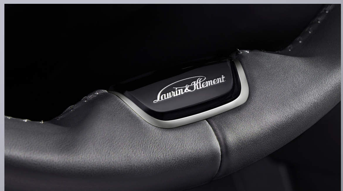
Enyaq & Enyaq Coupé

The years indicate the model's entire production period; the production period of the L&K trim usually differs slightly.