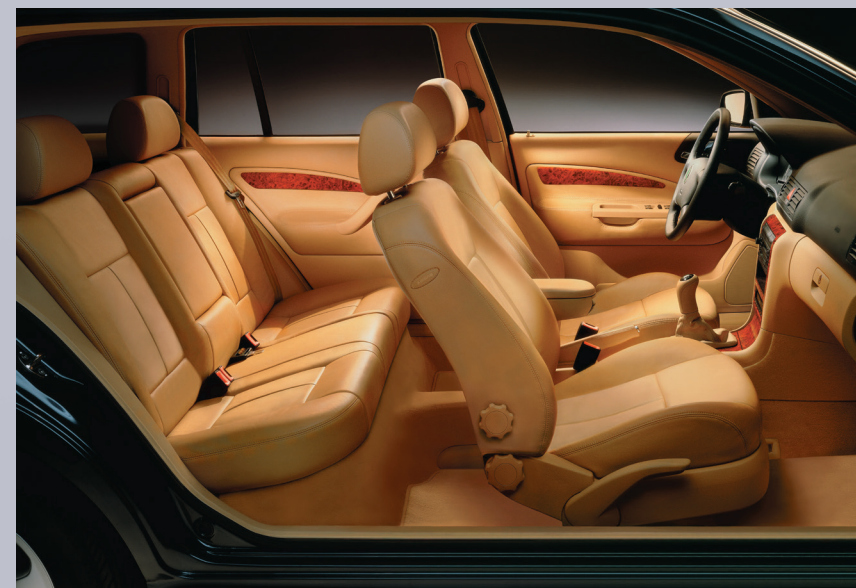
Octavia I 1996–2004*