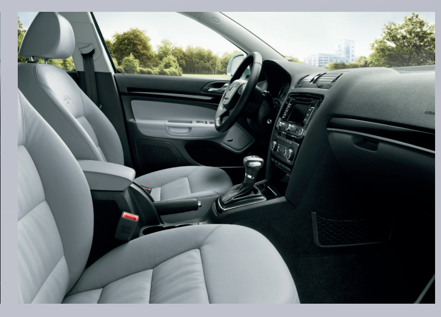
Octavia II 2004–2012