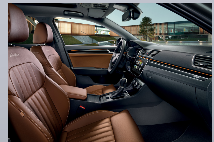
Superb III as of 2015