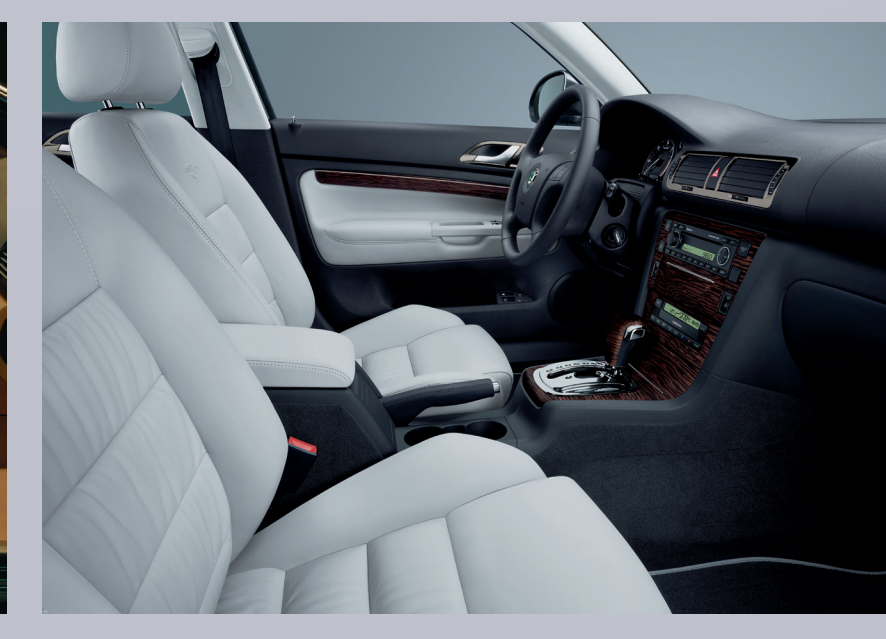
Superb I 2001–2008