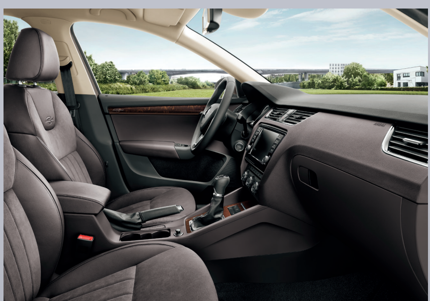
Octavia III 2012–2020