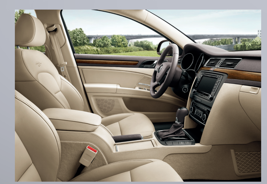
Superb II 2008–2015